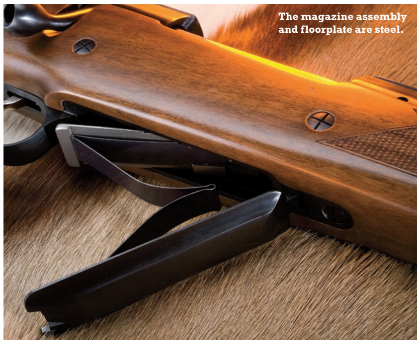
The magazine assembly and floorplate are steel.