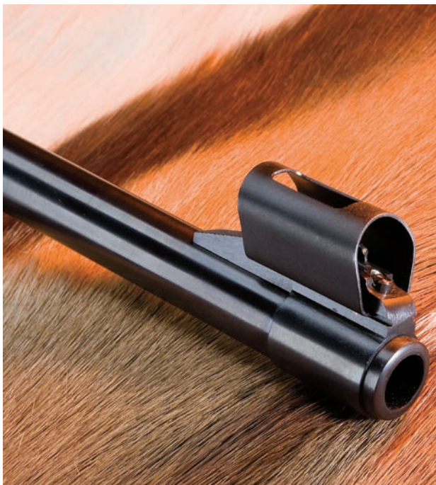
A barrelband front sight complements the trio of rear leaf sights.