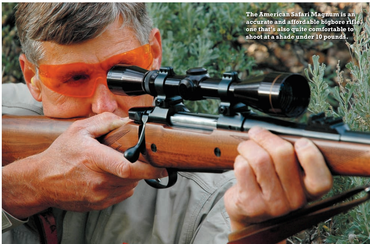
The American Safari Magnum is an accurate and affordable bigbore rifle, one that's also quite comfortable to shoot at a shade under 10 pounds.