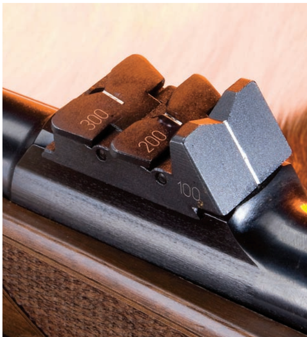
Three open sights (two hinged) feature white center lines under broad V's for quick aim.

CARTRIDGES SLIDE DUTIFULLY FROM BOX TO CHAMBER, WITH NARY A HICCUP.