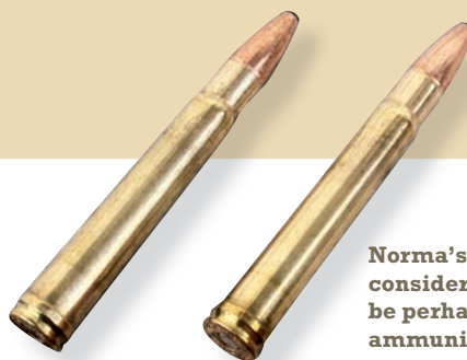
Norma's Oryx line is considered by many to be perhaps the finest ammunition in the world.

The heart of the CZ 550 is the good old Mauser controlled-round-feed action, the primary difference from Peter Paul Mauser's original being the side-mounted thumb safety.