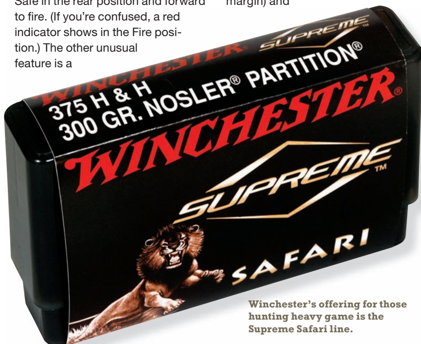
Winchester's offering for those hunting heavy game is the Supreme Safari line.

Accuracy was superb, but it took the author some work to get onto the open sights. Nobody shoots irons exactly alike, and he had to flip up the 200-yard leaf in order to get the point of impact correct at 50 yards. The rear sight arrangement consists of one fixed and two folding blades.