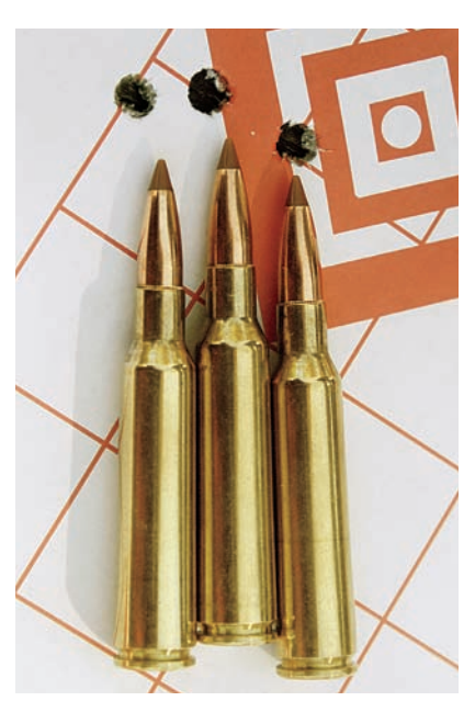
These 120-grain Nosler ballistic tips did very well on the range and in the field.